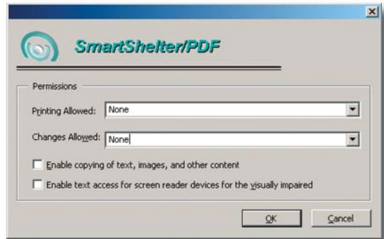
Individual rights for changing or printing