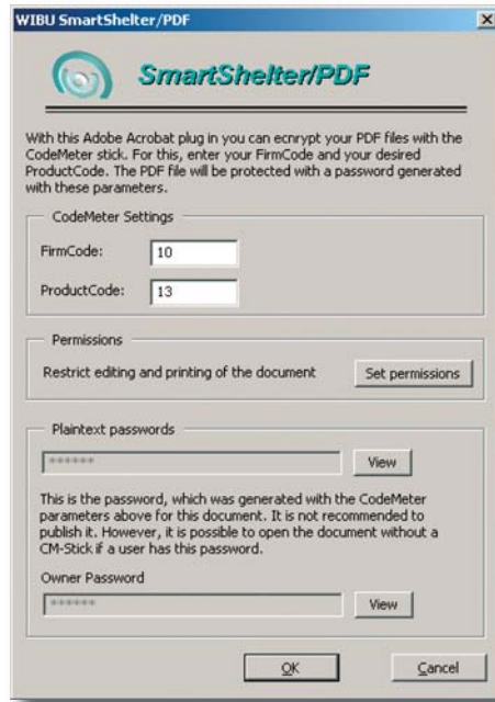
Dialog for encryption of the document

The Adobe Acrobat Reader opens the PDF document as usual. After detecting a CM-Stick with the suitable license code entry, the document will be opened. In absence of the CM-Stick the password dialog pops up and requests for manual password entry.